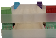
Paraffinblock Tray double

I. Storage cabinet for the storage of approx. 154,000 standard slide carriers 76 x 26 mm or about 21,200 paraffin blocks with simple storage 10 full extension drawers (100% extendable) incl. Trays Measurements: H x W x D 1100 x 1046 x 750 mm